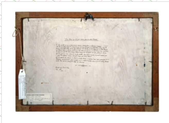
ABOVE: Ann Shelton, Back of Painting (Lionel Terry, The Path of Glory leads but to the Grave, 1933) , Hocken Collections, 2008, C-type photograph, 515 x 370mm.