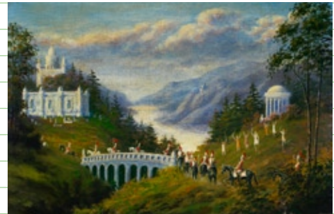
Lionel Terry, The Path of Glory Leads but to the Grave , 1933, oil on wood panel, 381 x 526mm, Hocken Collections, University of Otago.

Shelton's photographs in once more with feeling reveal the impossibility of presenting the 'complete picture' in terms of a cohesive visual field and in terms of reproducing historical narratives without absences. Her remakes of historical paintings renegotiate the primacy of sight and shatter the Cartesian logic that governs conventional landscapes by using the inverted mirror image and conceptualism to deflect monocular vision and to figuratively take