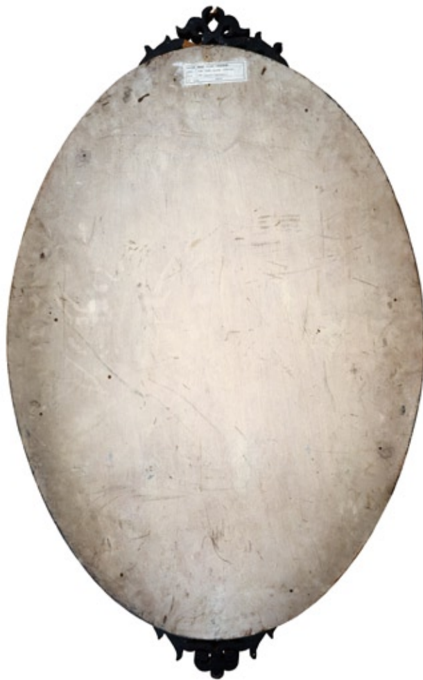
RIGHT: Ann Shelton, Back of Painting (Lionel Terry, [Moonlit landscape] n.d.) , Hocken Collections, 2008, C-type photograph, 370 x 515mm.