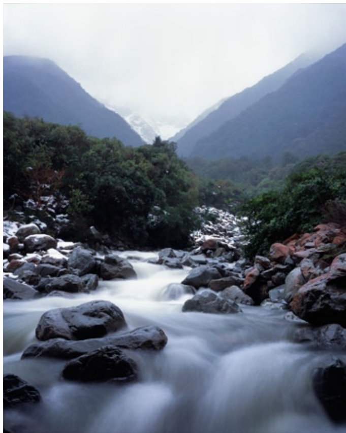
Ann Shelton, Wintering, after a Van der Velden study, Otira Gorge , 2008, diptych, C-type photographs, 1214 x 1520mm each.