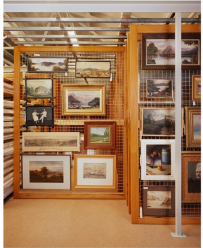
Ann Shelton, Artist unknown rack 4 , Hocken Collections , 2008, C-type photograph, 800 x 1000mm.