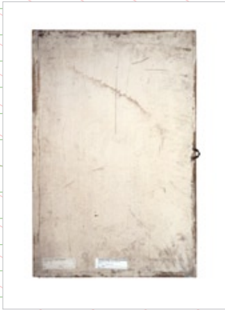
TOP: Ann Shelton, Back of Painting, (Lionel Terry, [Self portrait]) , Hocken Collections, 2008, C-type photograph, 515 x 370mm.