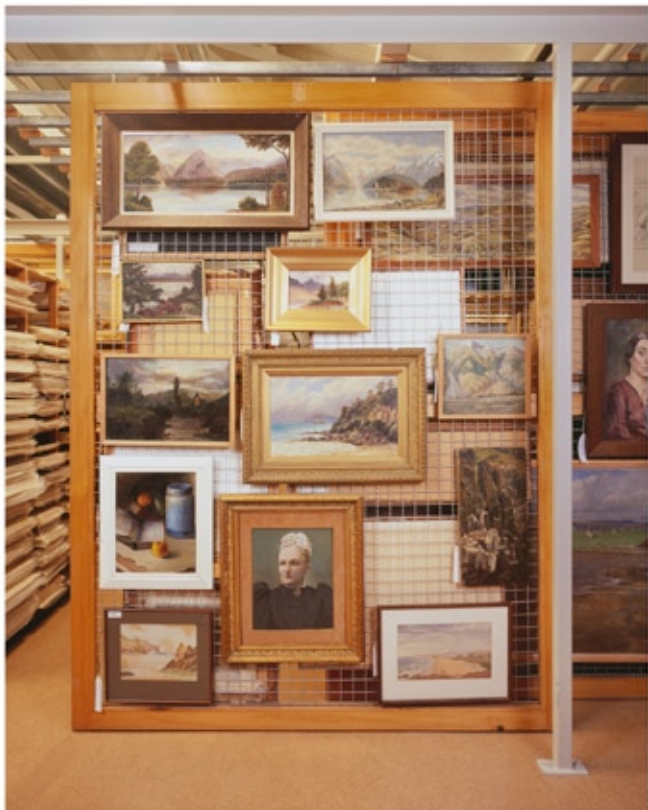
Ann Shelton, Artist unknown rack 1 , Hocken Collections , 2008, C-type photograph, 800 x 1000mm.