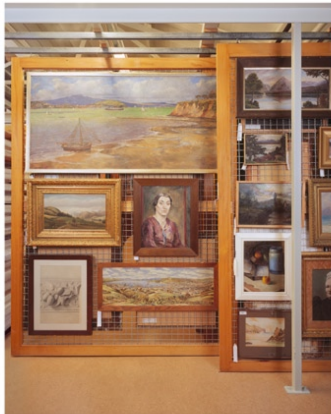
Ann Shelton, Artist unknown rack 2, Hocken Collections , 2008, C-type photograph, 800 x 1000mm.